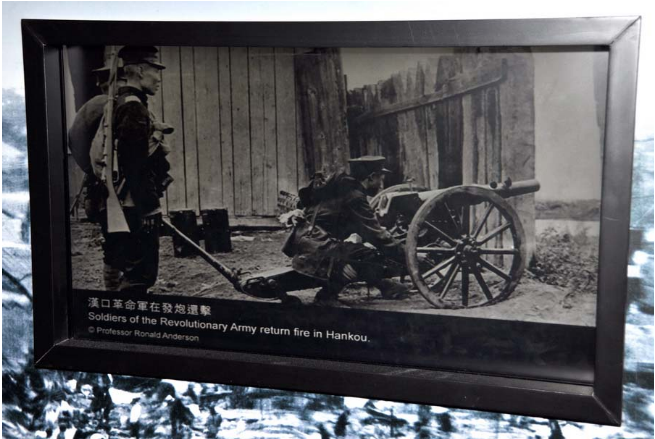
Figure 7. One of about 20 Stafford Photos in Electronic Picture Frame Show