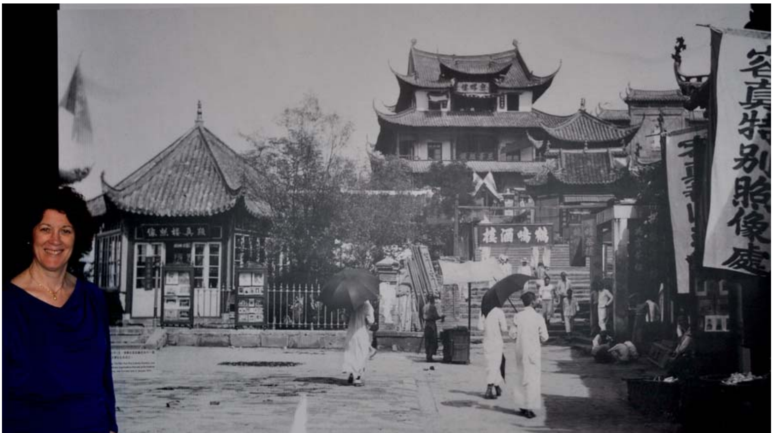
Figure 6. Nancy with Yellow Crane Photo