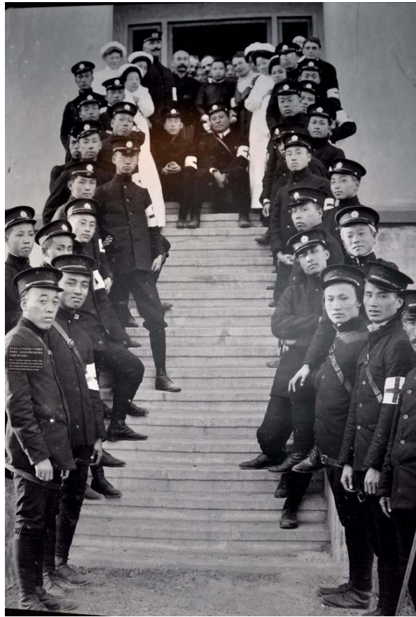
Figure 9. 10-Foot Stafford Photo