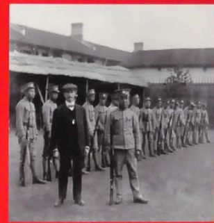
施塔福在陽夏之戰的戰場上與清軍合照 The photographer Francis Stafford with Qing troops at the Battle of Yangxia.