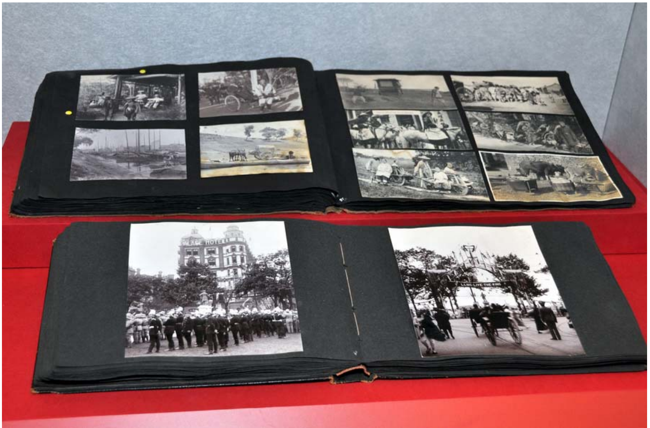
Figure 23. Two more Stafford Albums in Case