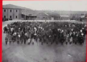
上海商務印書館的職員大會照，約攝於1914年。 Group photograph of staff of the Commercial Press, Shanghai, taken around 1914.