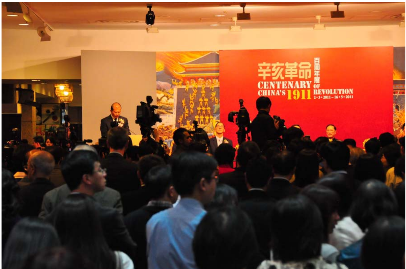
Figure 2. Speech by HKG CEO