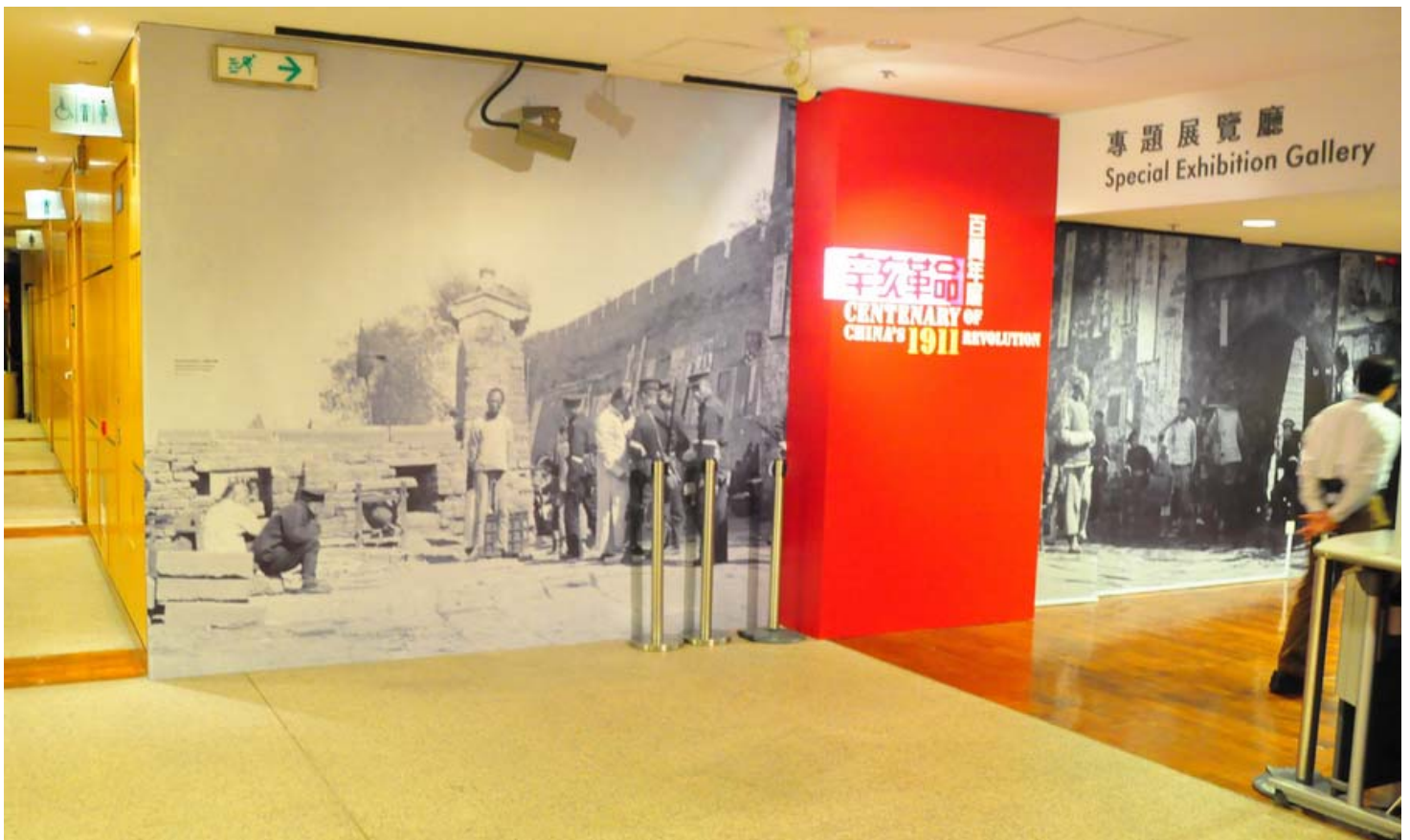
Figure 4. Photo at Exhibit Entrance - 25-foot Stafford Photo