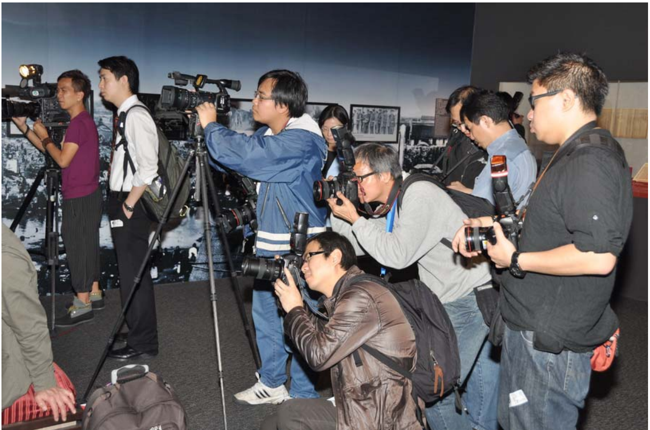
Figure 16. Photographers Capturing Lecture