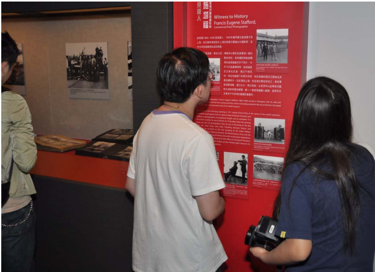
Figure 13. Viewing both the Album Display Case and Stafford Photo Panel