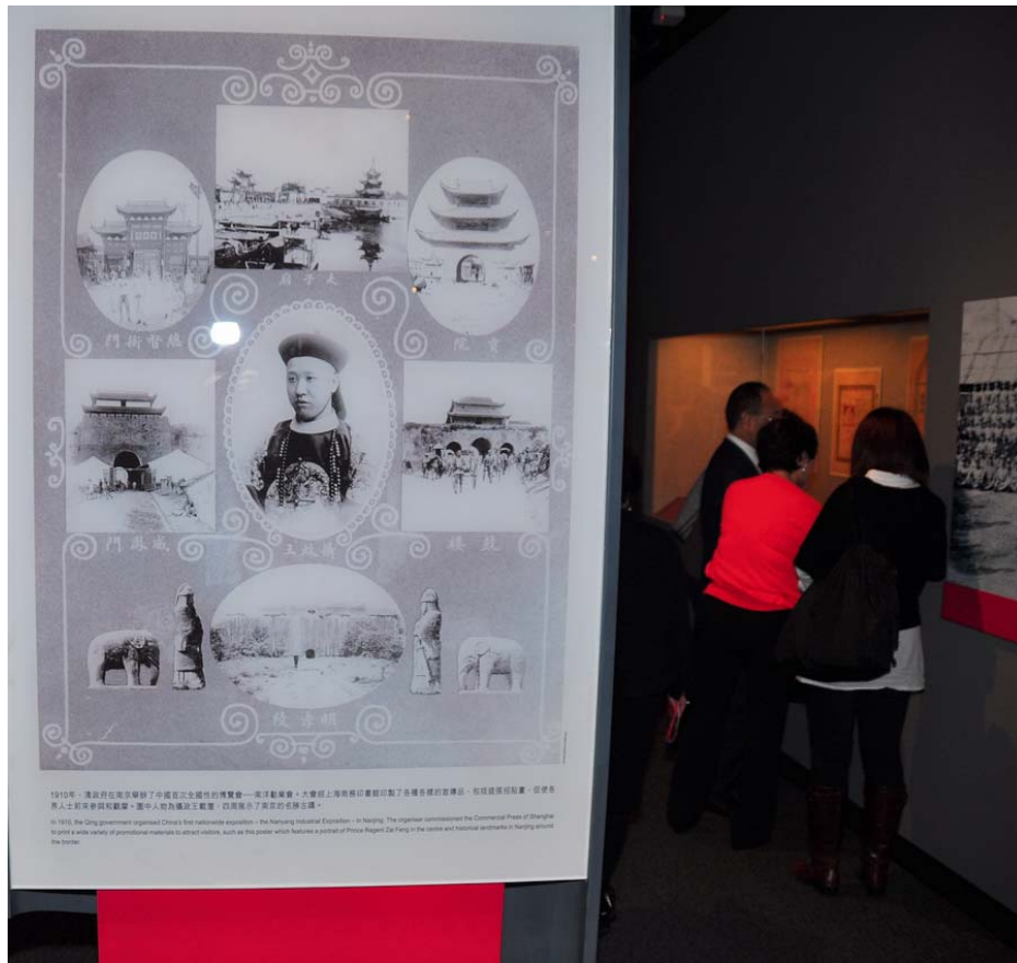
Figure 5. Stafford Collage Enlarged 10-Fold