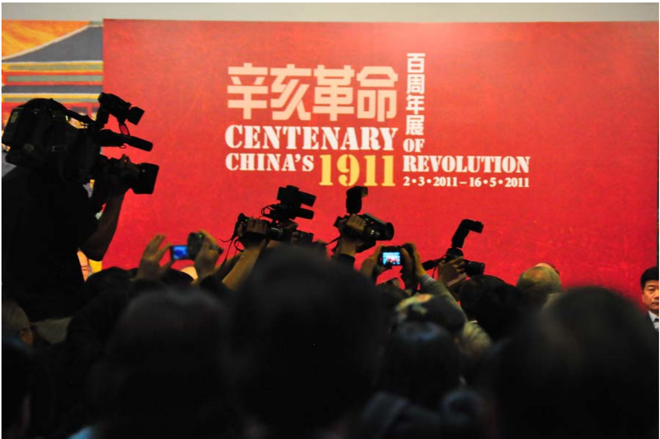
Figure 3. Press Capturing Demonstrators During Speech