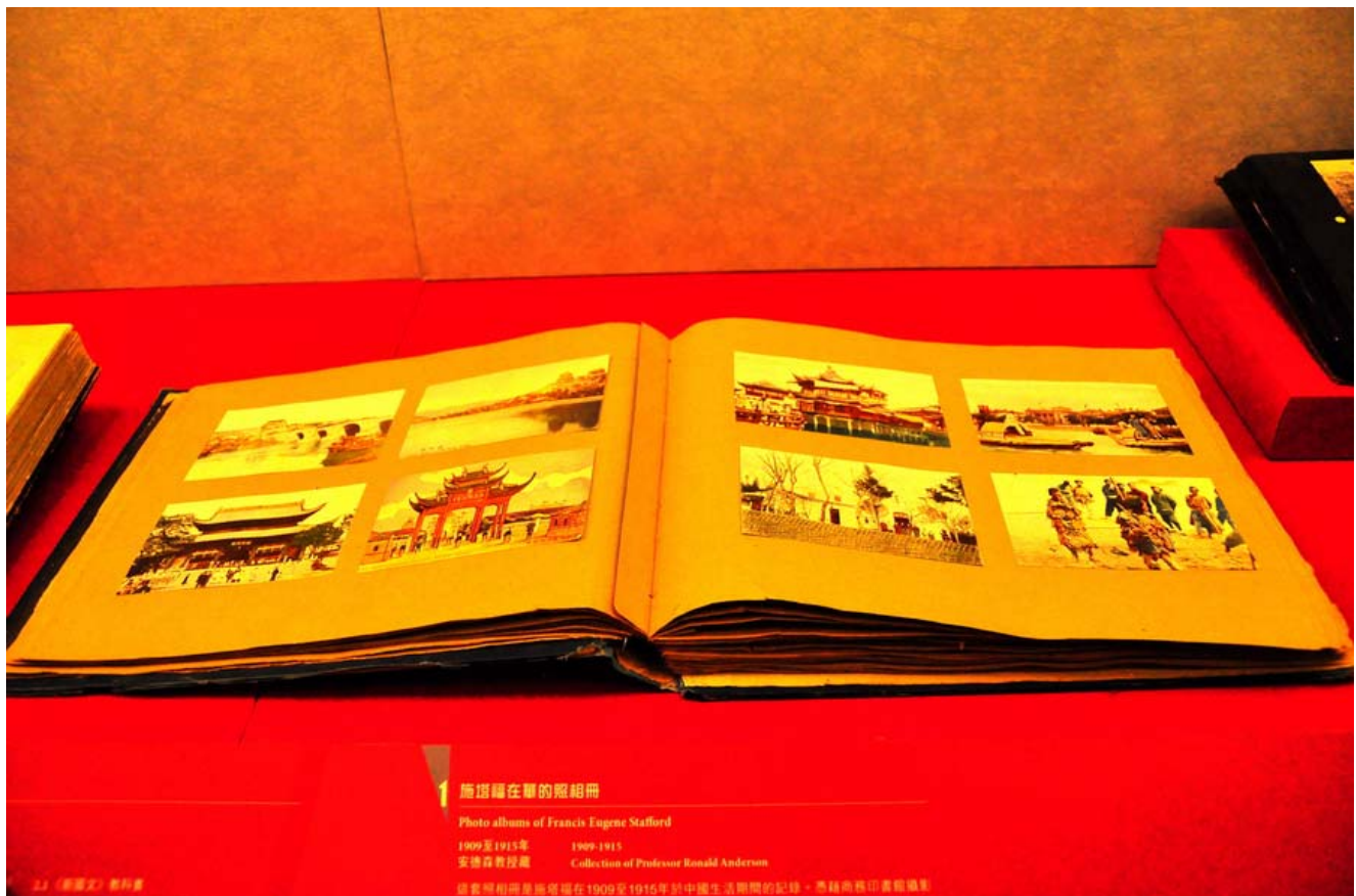
Figure 22. Album in Case with Color Photos