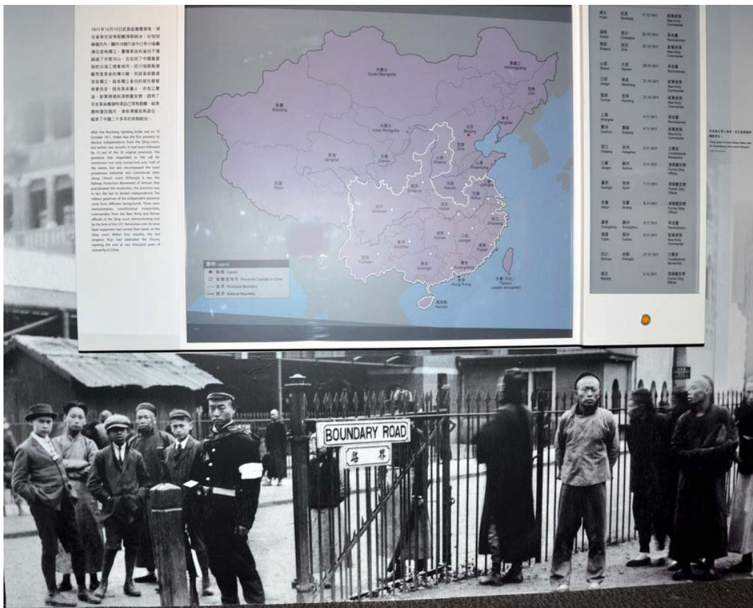
Figure 8. 10-Foot Stafford Photo with Map Superimposed