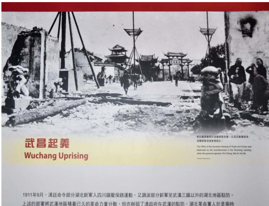
Figure 20. Typical photo display