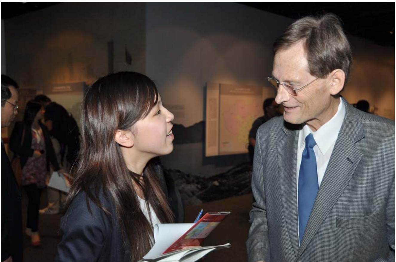
Figure 18. More Press Interviews