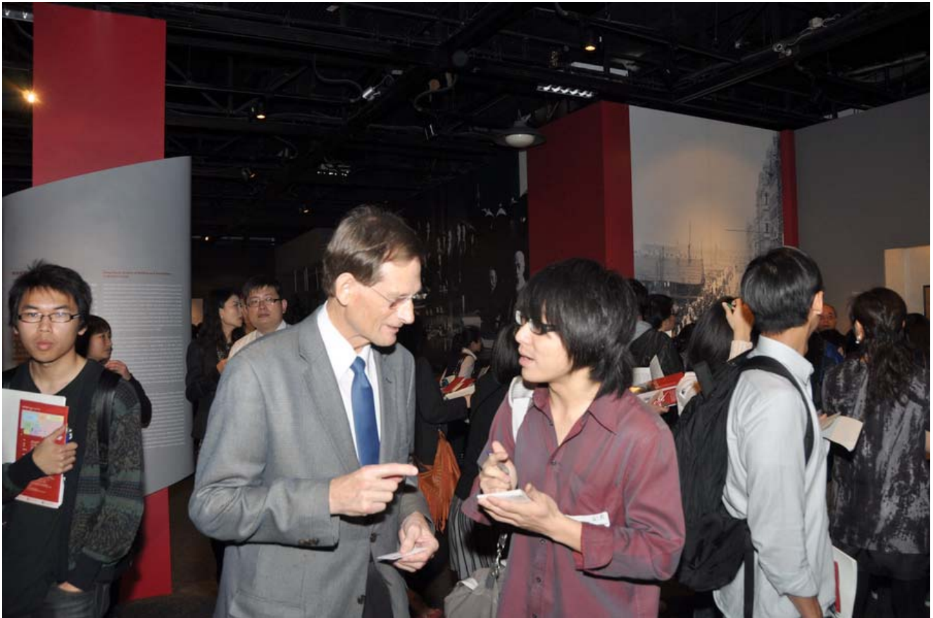
Figure 17. Press Interview