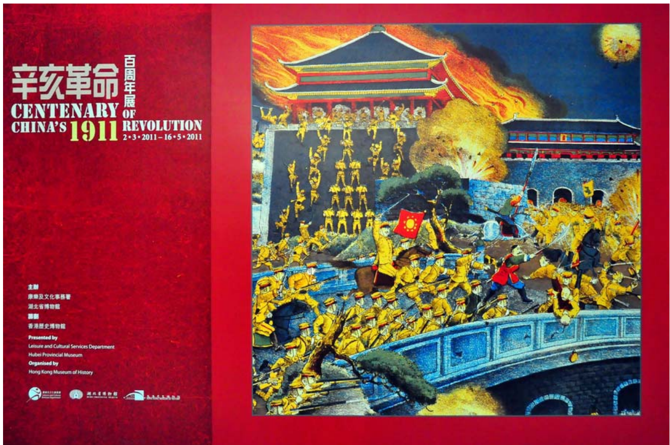
Figure 1. 12-Foot Entrance Mural by Japanese Artist